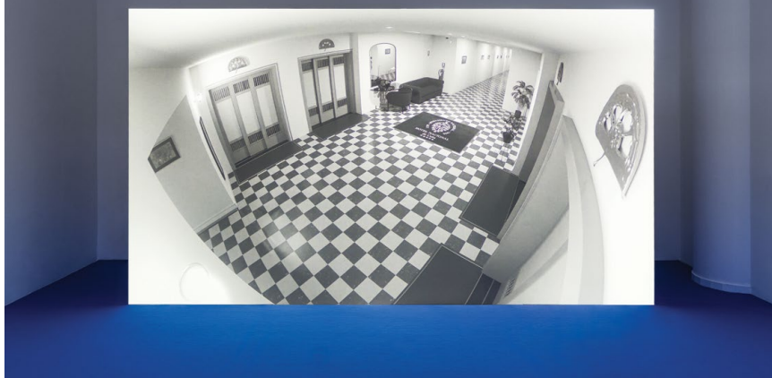
Installation view of SUNG TIEU's Moving Target Shadow Detection , 2022, single-channel video installation: 18 min 56 sec, at "Hotel Nacional de Cuba," Kunstverein Gartenhaus, Vienna, 2022.

Tieu's interest in architectural apparatuses of control spans the vast and conspicuous, to devices so insidious to have become commonplace. At one end of the spectrum are the seven earth-filled steel sculptures that make up the installation Civic Floor (2022), first shown in Luxembourg at MUDAM in 2022 and recently opened at the MIT List Visual Arts Center in Massachusetts, one of two exhibitions by Tieu to launch in the US this year. Each sculpture references a historic prison design, from 19th-century radial designs to a new generation in the 1990s. Their respective floorplans visible from above, the sculptures are swathed in a haunting soundtrack evoking the slow ticking of clocks and the drip, drip, drip of water, suggestive of incarceration.