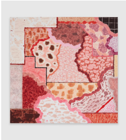
Rebecca Morris, Untitled (#08-17), 2020.