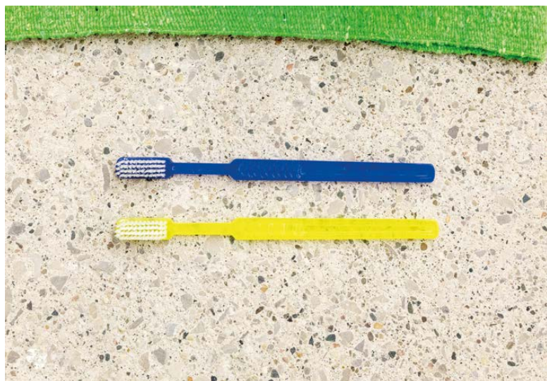
Toothbrushes (Green), 2014