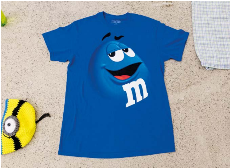
Blue M&M Shirt, 2014