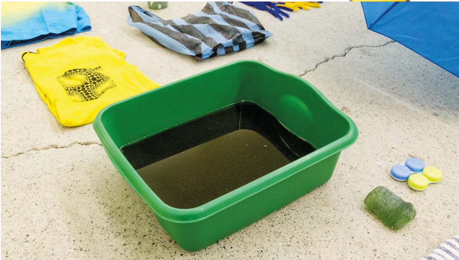
Darren Bader Bootleg , 2014, Green installation view at What Pipeline, Detroit, 2015.