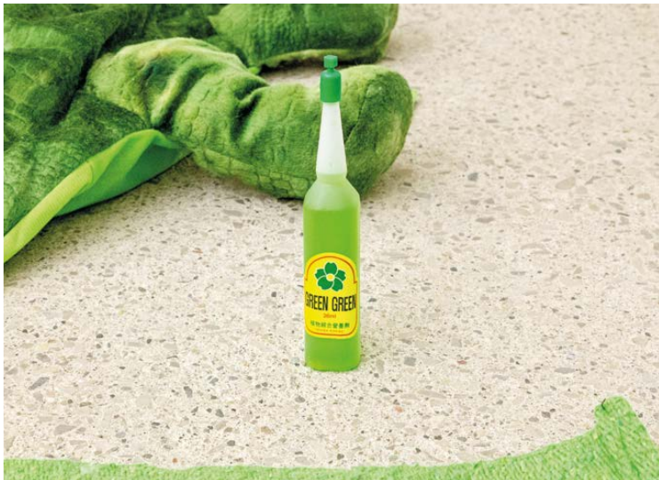
Asian Plant Food (Green), 2014