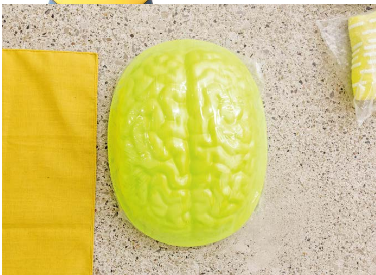
Green Brain, 2014