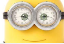
My Last Breath before turning 22, 2011