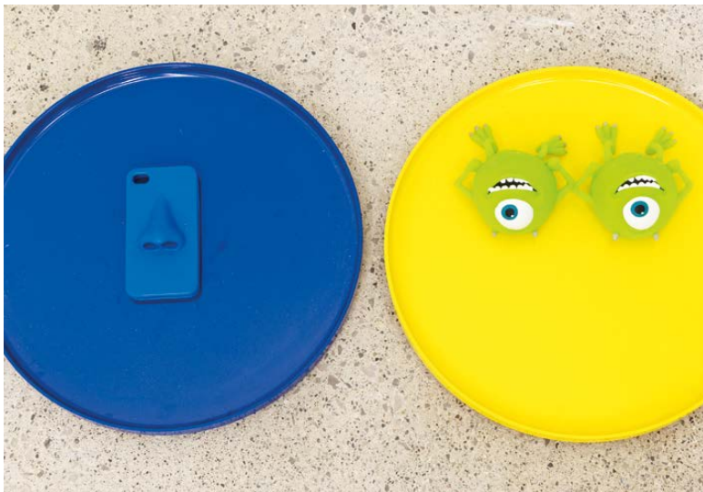
Two Faces, 2015