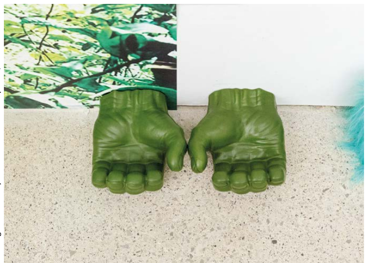
Hulk Hands, 2014