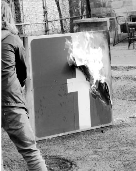
Burning Facebook App Performance, 2015.