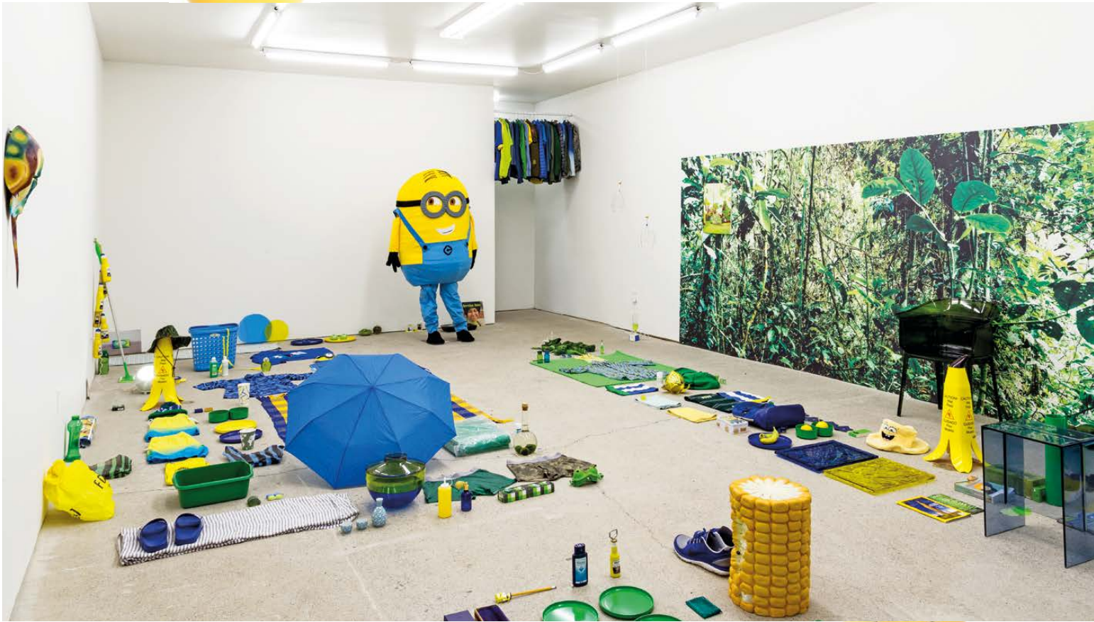
Green installation view at What Pipeline, Detroit, 2015.