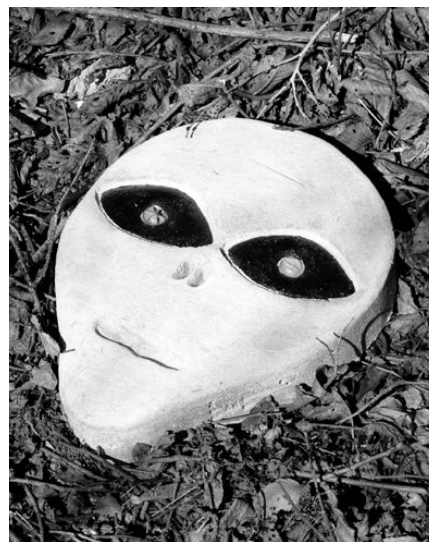
Green Eyes, 2014.