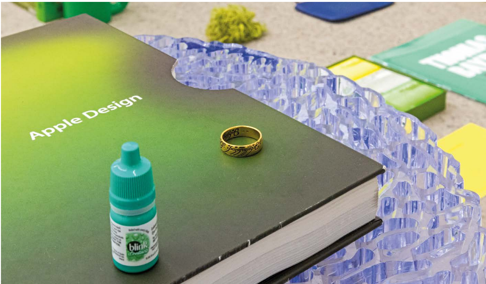
Top – Minion Performance , 2015. Courtesy: the artist and What Pipeline, Detroit Bottom – Lord of the Rings Ring , 2014. Courtesy: the artist and What Pipeline, Detroit