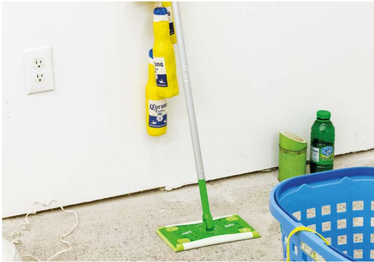
Coronas on Swiffer, 2015