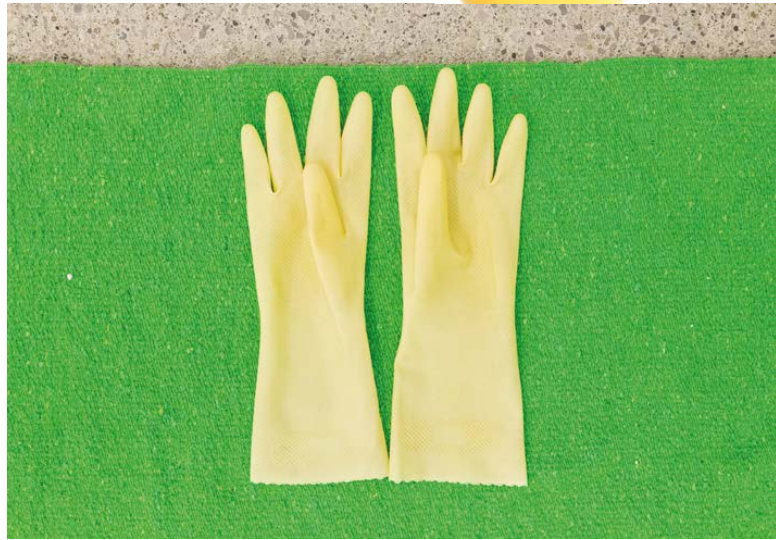
Yellow Latex Gloves, 2015