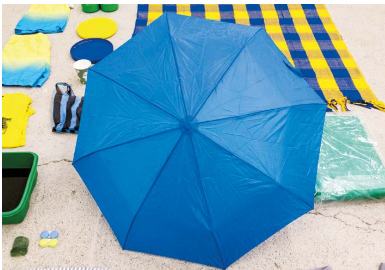
Blue Umbrella, 2015