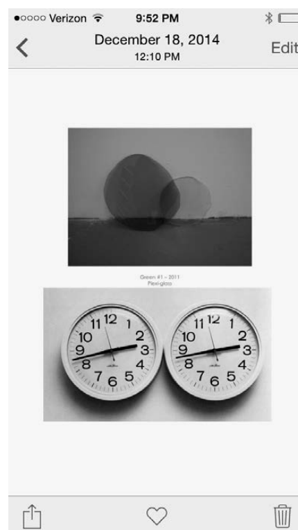
Press release for Green, What Pipeline , Detroit, 2015.

I often learn things about my spouse's emotional life first through the work of Puppies Puppies. For example, it wasn't until I was halfway through writing the press release for an exhibition they had this past summer that I realized they were considering adopting a child. Coming to understand the exhibition led to a realization that may eventually have dramatic implications for my own life that completely shocked me, and that filled my heart with emotions.