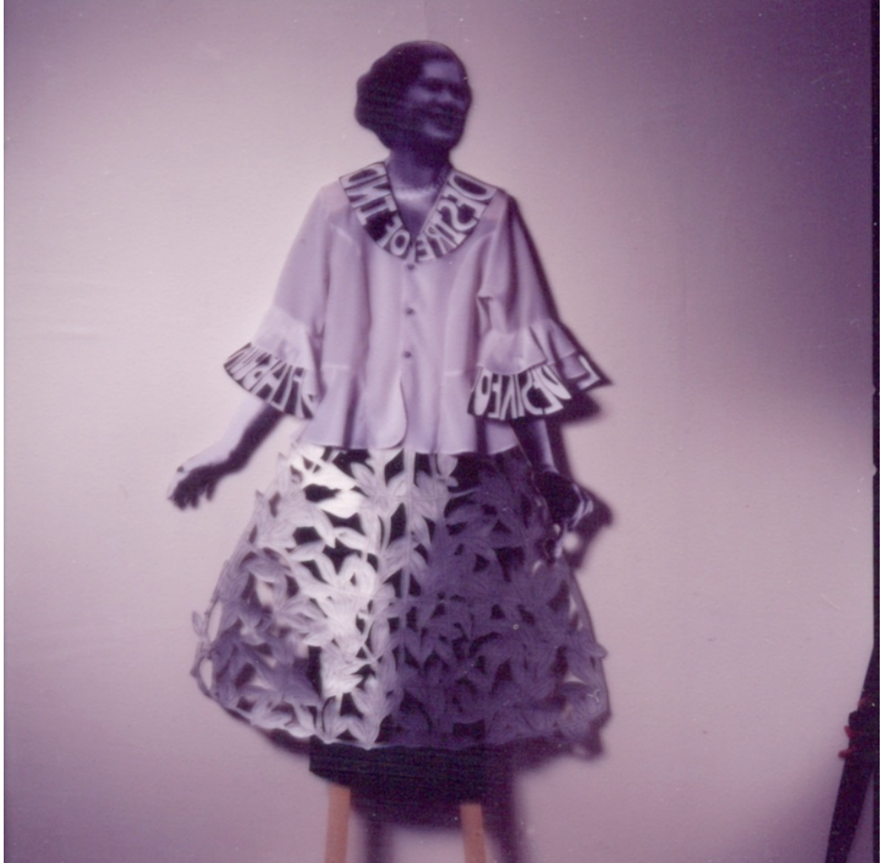
Alice Creischer, The Greatest Happiness Principle Party (detail), 2001

Nevertheless, there are differences that depend upon how the local context reacts to these approaches: differences in the resistance to them as well as in the opportunism of elites.