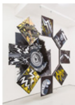
↑ Autofelatio, 2018 Oil on linen, steel structure, hardware 290 x 290 cm → Autoeroticism, 2018, Oil on canvas 190 x 368 cm + tongue.

happening in our reality and preserve our identity, which can also be a form of nationalism, essentialism or even "folklorism."