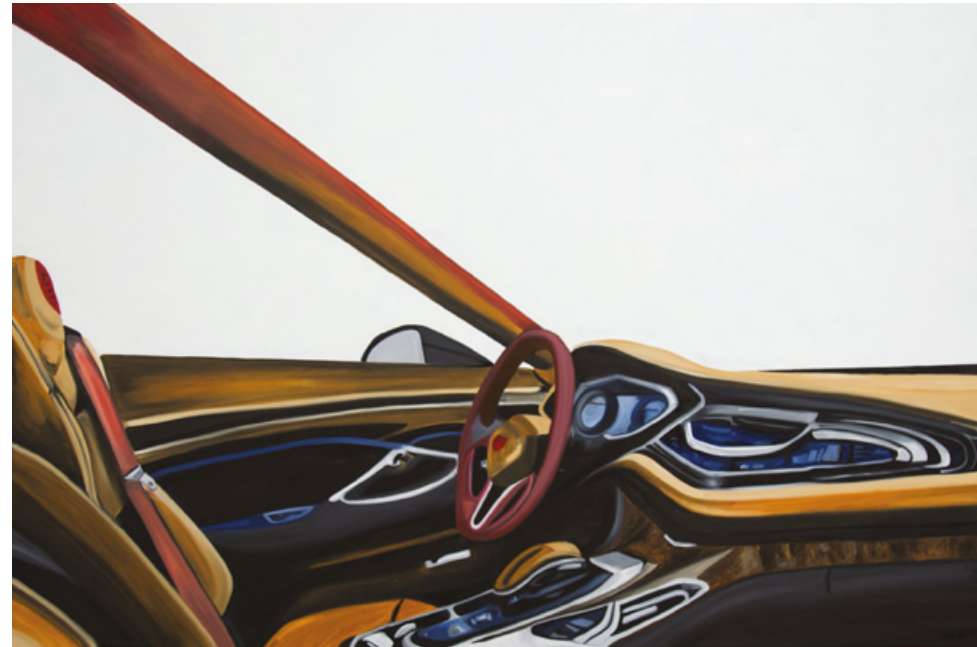
→ Desert Landscape, 2018 Oil on canvas 167 x 212 cm.

FT: As people who come from former colonies, current colonies or currently failed democracies, we don't need these very specific standards imposed upon us. As it currently stands, we are expected to present our culture in a way that is digestible for the western eye, or report to the world on what's