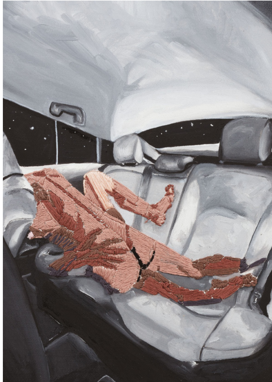
↓ Tiborina nocturna, 2017. Oil and embroidery on canvas, 30 x 40 cm.